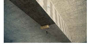
Applying epoxy resin adhesive