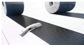
Cutting carton fiber cloth