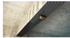
Applying adhesive again