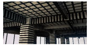
Curing and protecting